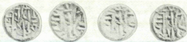
(photographs are enlarged to twice natural size)

Obv. Sri Ro vi na ॐ ॐ ॐ ॐ Gu - trident - ta Rev. blank ॐ ॐ ॐ ॐ Weights. 0.40, 0.40, 0.37 and 0.30 gm